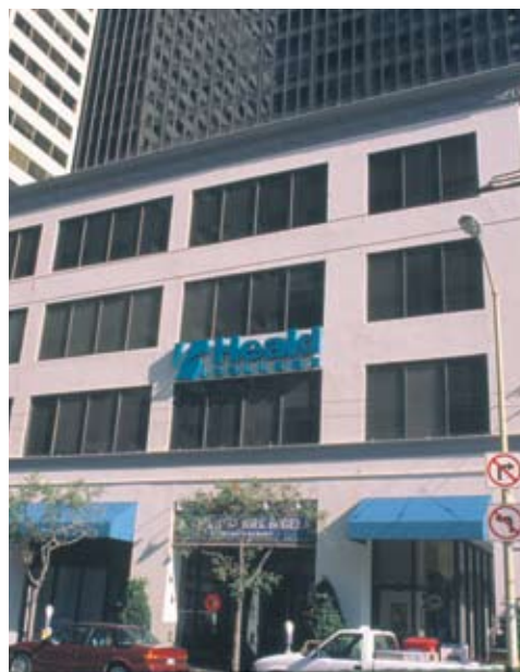
San Francisco Campus