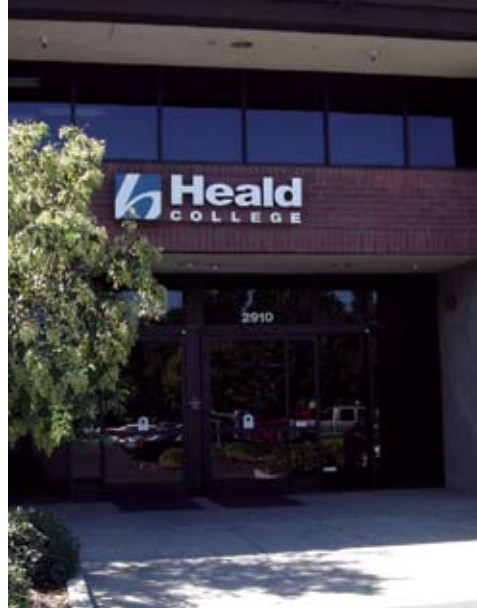
Rancho Cordova Campus