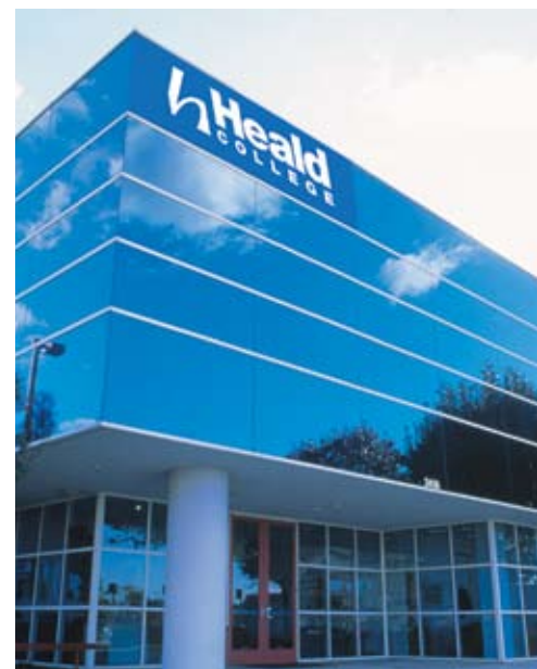
San Jose Campus